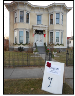
Adler House Museum was a very popular first stop on the Historic Baker City Home Tour December 10, 2011

There is no charge for the training. We only ask that you make a commitment to use your new skills volunteering to assist at the museum.