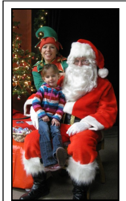
Santa and his elf stopped in to visit with our guests the weekend after Thanksgiving.