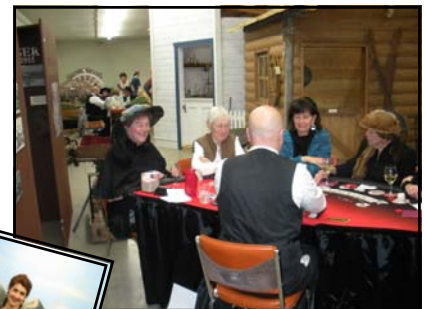
Photo souvenirs of a memorable evening and successful fundraising event. Thanks to everyone who attended, volunteered and found it in your hearts to open your pocketbooks to support this fun Casino Night event. We look forward to next year!