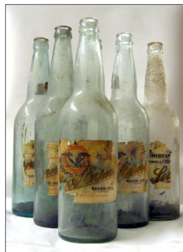
C. 1905 Beer bottles from the American Brewing & Crystal Ice Co., Baker City