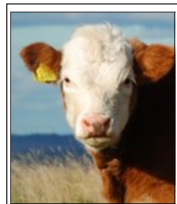
"Baker County Fairs, 4-H and Agriculture," featured 2012 Central Gallery Exhibit

So what do we have planned for the 2012 Central Gallery exhibit? Baker County Fairs, 4-H and Agriculture! We'll need to do some painting, and a little construction over the closed season, and could use some barnwood. We are also hoping to have an antique tractor show—watch for more on that. Call us if you would like to get involved!