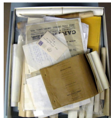
Above & below: two of the many boxes of archive material to be sorted.

Thank You D.E. & Jane Clark Foundation Oregon Cultural Trust