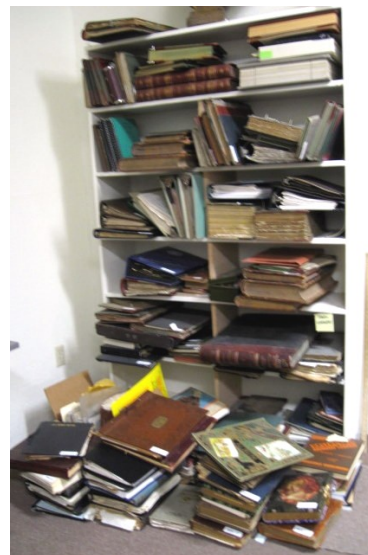
Business and personal ledgers, journals, scrapbooks and other items waiting for shelving and archival boxes.

Initial orientation and training will be held November 2 , from 1-3:30pm in the Curation Room at the museum.