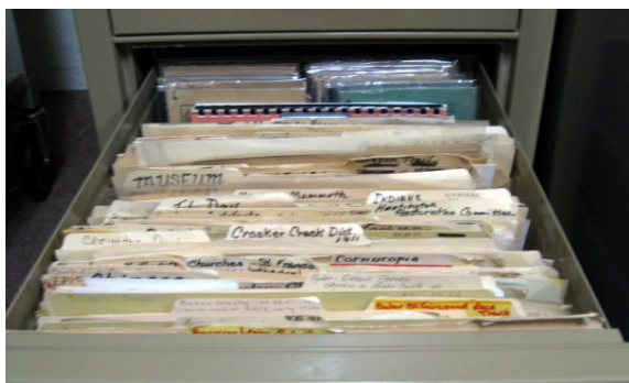
One of several file drawers and boxes of historical information to be cataloged and stored in archival file folders.