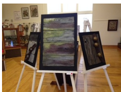
Great local artwork inspired by the Museum. We loved displaying it in our ballroom!

This season has been an amazing experience, we’re gearing up for some great events and programs for 2016!